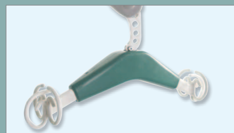
Tri Hook Yoke