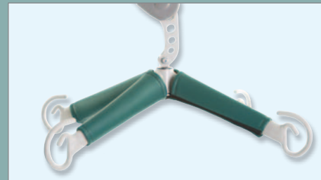
4 Point Yoke