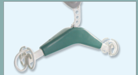
Tri Hook Yoke