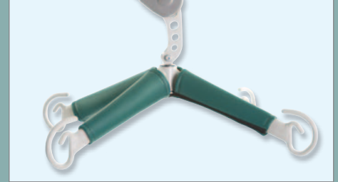
4 Point Yoke