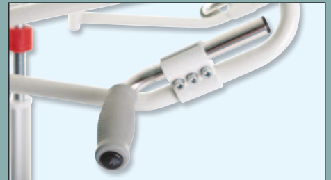
Tempo Handle Kit