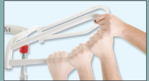
Multiple Grip Positions

With a small footprint and low overall weight, the Salsa 200 is highly maneuverable. A high capacity safe working load of 200kg means the Salsa is equally at home in an institutional or home environment.