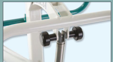
Knob Kit for Custom Sitting Sling