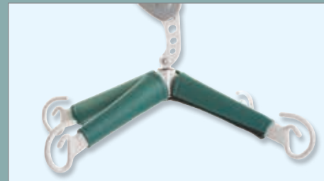
4 Point Yoke