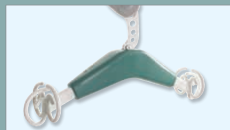
Tri Hook Yoke