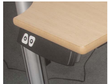
Ingress Protected electric buttons