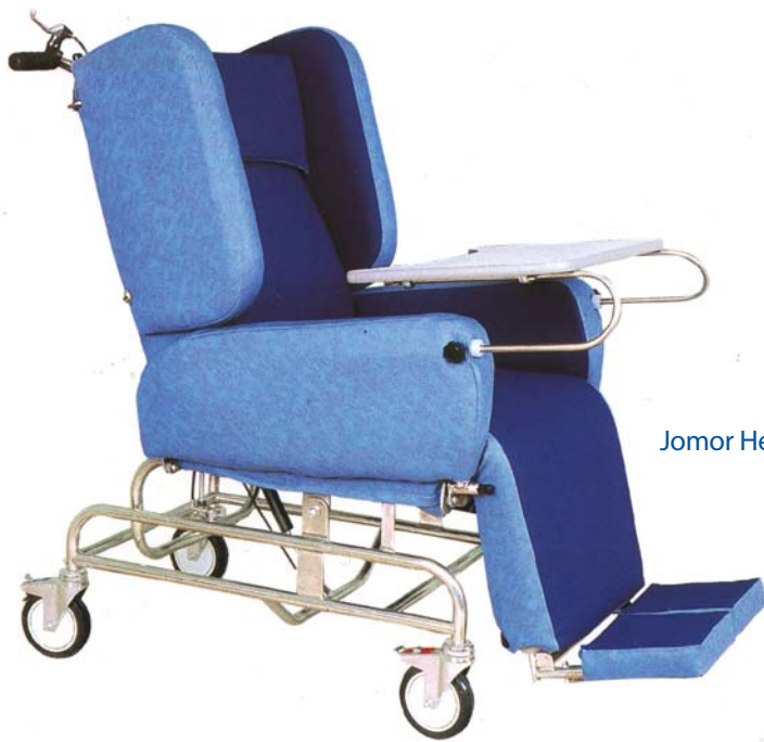
Jomor Healthcare - Air Chair