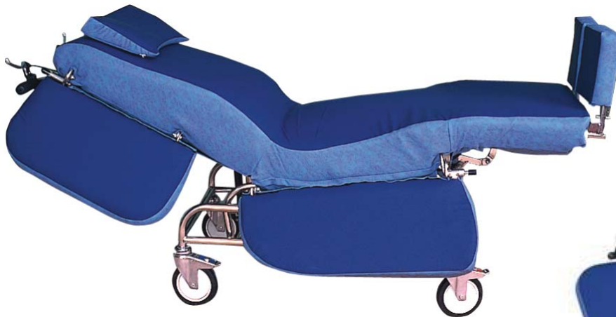
Fold-away wings for easy transferring of patient