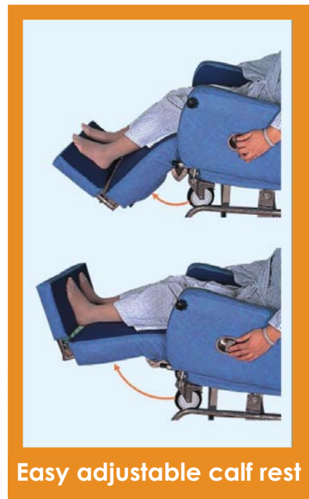
Easy adjustable calf rest