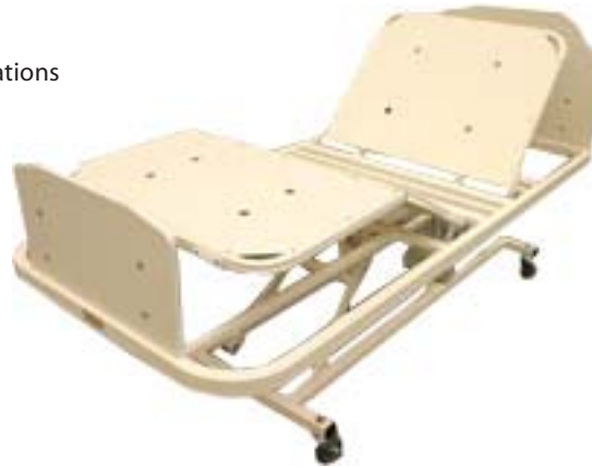
Jomor Healthcare "Marion" Kneebend Electronic Hi-low bed