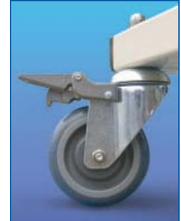
4 locking bearing castors