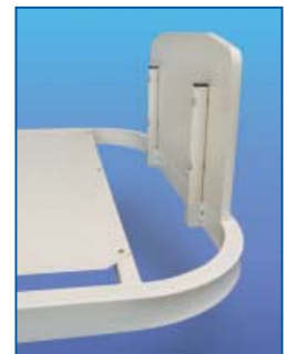
Safe rounded corners