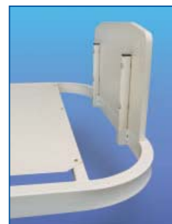
Safe rounded corners