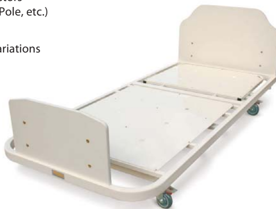
Jomor Healthcare "Marion" Electronic Hi-low bed