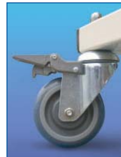
4 locking bearing castors